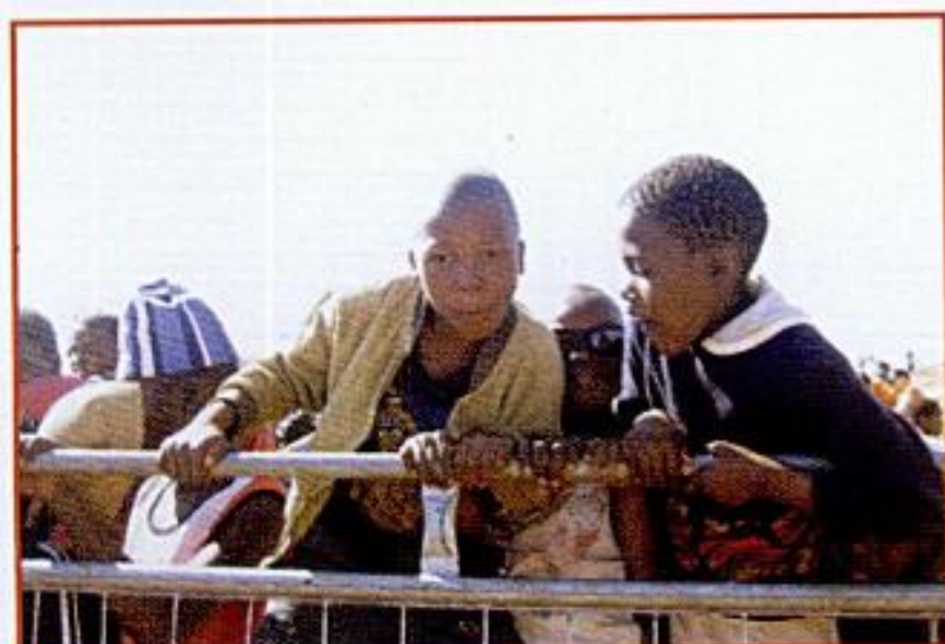
Westonaria community members having a ball